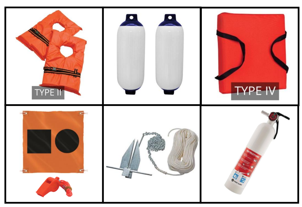
*All of the above comes FREE with a new pontoon from Charles Mill Marina