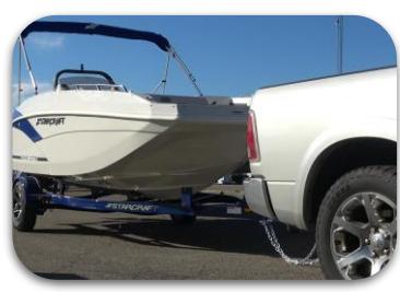
EASY TO TRAILER